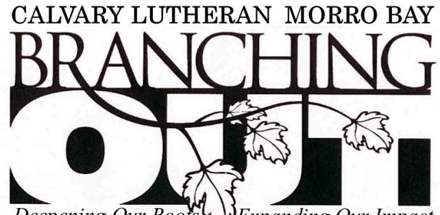
Deepening Our Roots Expanding Our Impact

This is not meaningless talk. It's a clue to how we can see stewardship as a mutual opportunity to bless and be blessed. We are blessed to be a blessing.